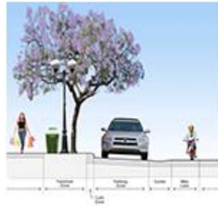
Streetscape Plans & Conceptual Design Guidelines