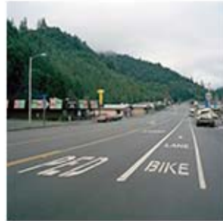
Bike, Ped & Trail Plans