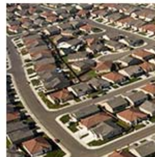
Smart Growth, Land Use & Housing Plans