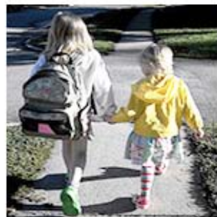
Safe Routes to School Plans