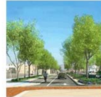
Complete Streets Plans