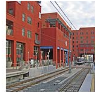
Public Transportation & TODs Plans