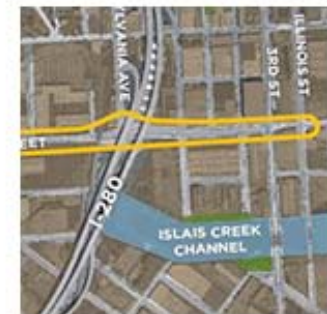
Corridor Management Plans