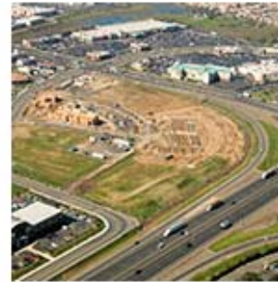
Economic Development & Revitalization Plans