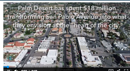
Palm Desert finishes $18 million San Pablo Avenue project Palm Desert finishes $18 million San Pablo Avenue project hoping the area becomes the "heart of the city."