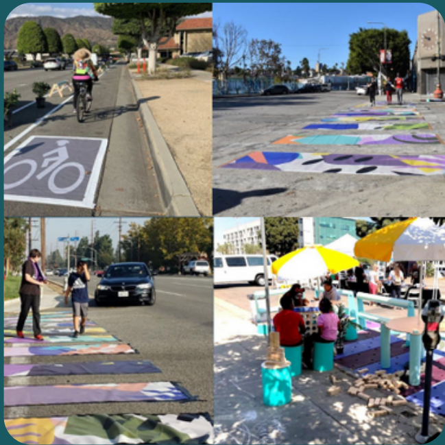
"Go Human Kit (a no-cost engagement tool for local agencies to demonstrate temporary, pop-up safety improvements)" - Hannah Brunelle, SCAG