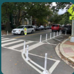
"Small Scale interventions" - Angie Schmitt, Author of Right of Way